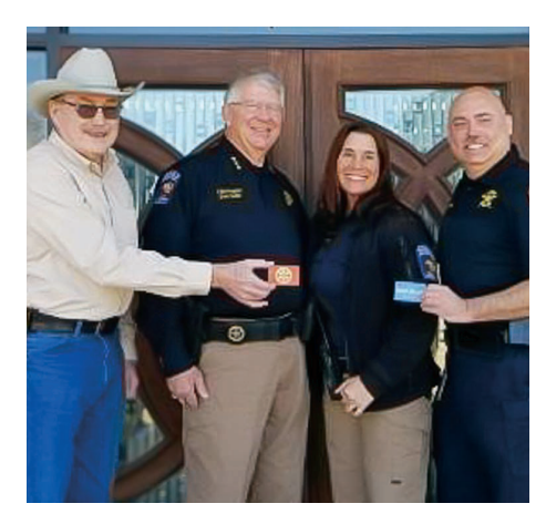
Texas Top Cop Shop

The Act applies to any pre-existing or newly formed business entity "created by the filing of a document with a secretary of state," but exempts 23 categories of firms, including large businesses and those involved in the financial sector, i.e., those with lobbyists. This means it applies mostly to small businesses and many non-profits-those least likely to be used for international money laundering. The