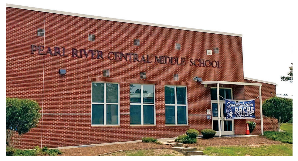
Pearl River Central Middle School

Though this case may seem trivial, it could have huge consequences. If the parents' suit succeeds, it would extend the reach of Title IX to ratify Biden Administration regulations that control minute details about school policy on controversial topics—or if we prevail, it could stop those power grabs and require Congress and state entities to set those policies.